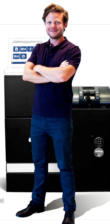
RCS-800 with note unit AST-7008